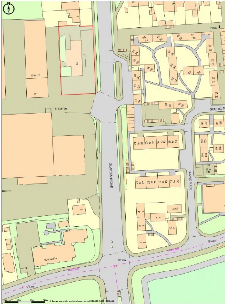
Promap LANDMARK INFORMATION OS AC0000813445 Plotted Scale - 1:1250. Paper Size - A4